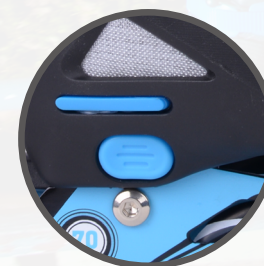
Easy Slide Size Adjuster