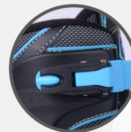
Safe Lock Buckles