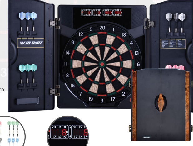
4 Jumbo LED Displays